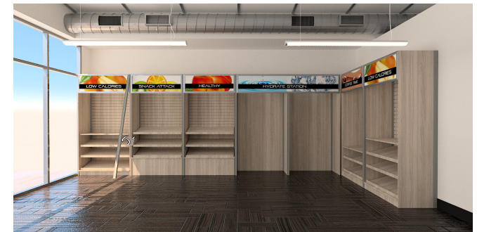
06- Add Shelving for Product