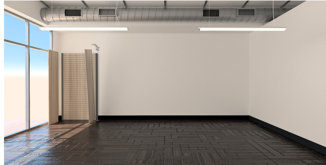
02- Connecting "T" Cornerform Conector & Panels