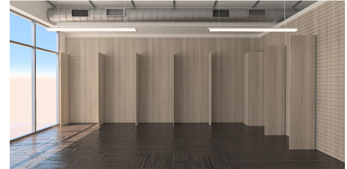
03- All Panels Aligned