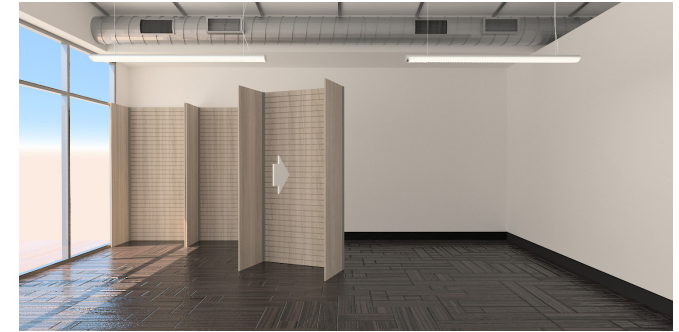
03- Pre-Assembled and Set in Place