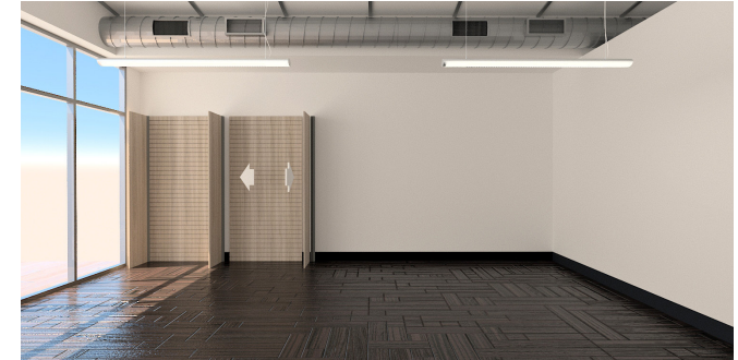
03- Snap On Panels