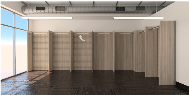
04- Add Ceiling Lamps