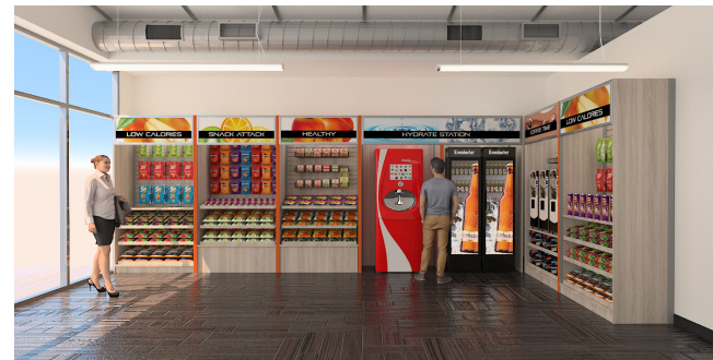
Final Step Add Products & Equipment