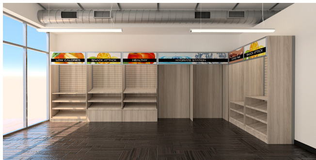
07- Add Shelving for Product