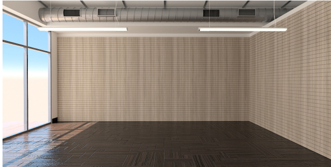
01- Your Space with Existing Slatwall