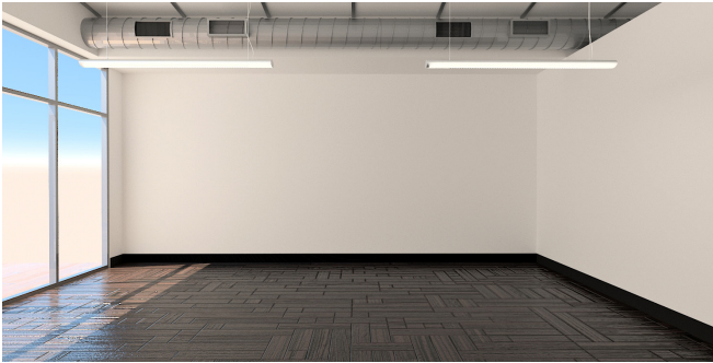
01- Your Empty Space