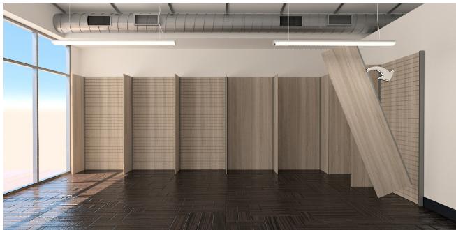
04- All Panels Connected