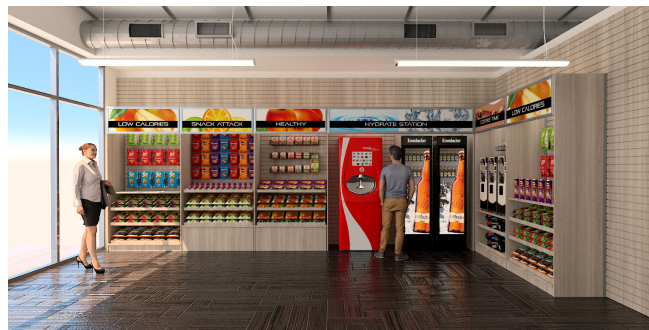
Final Step Add Products & Equipment