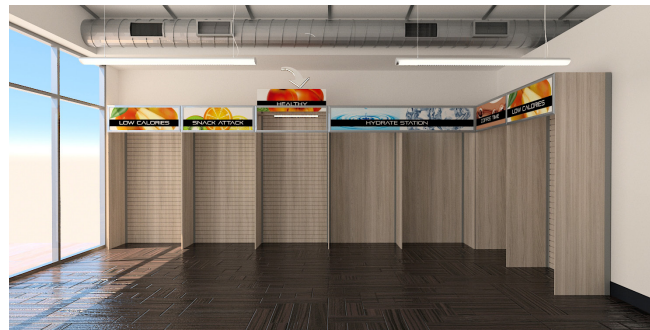
05- Add Versaflex Frames & Graphics