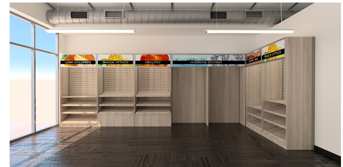
06- Add Shelving for Products