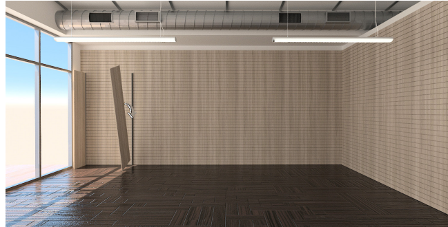
02- Add Cornerform Panels with Wing Clips