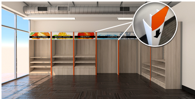
07- Add Double Finish Cornerform Endcaps