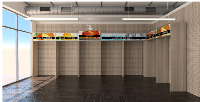
05- Add Versaflex Frames & Graphics