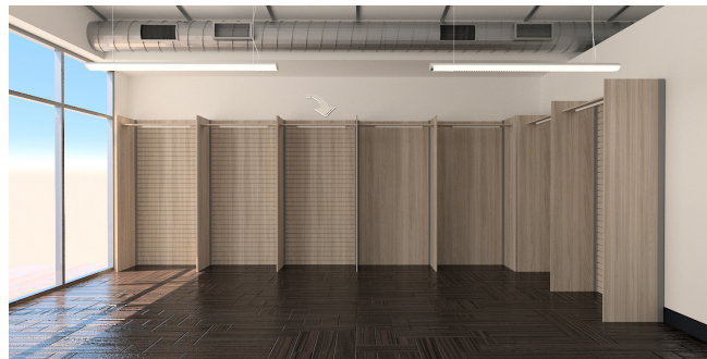
05- Add Ceiling Lamps