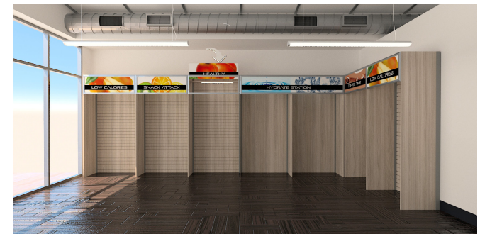
06- Add Versaflex Frames & Graphics