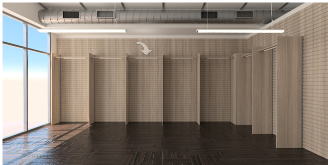
04- Add Ceiling Lamps