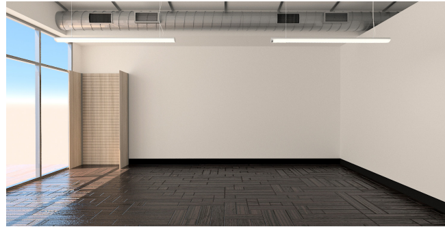
02- U-Shape Cornerform Units, Already Snap on